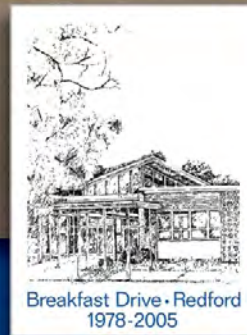
Breakfast Drive • Redford 1978-2005