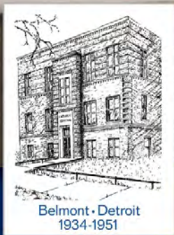
Belmont • Detroit 1934-1951