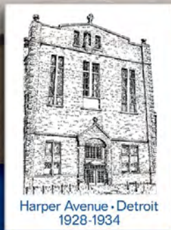
Harper Avenue • Detroit 1928-1934